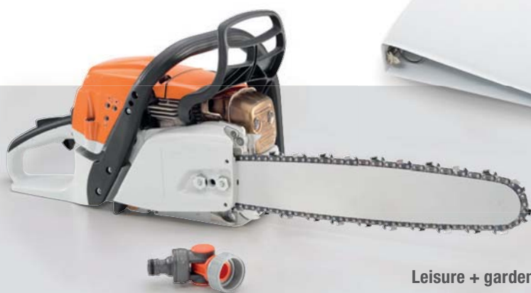
Leisure + garden